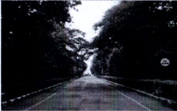
POWER HOUSE GATE