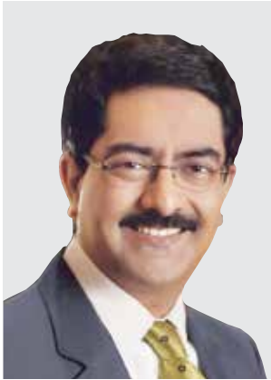
Mr. Kumar Mangalam Birla Chairman